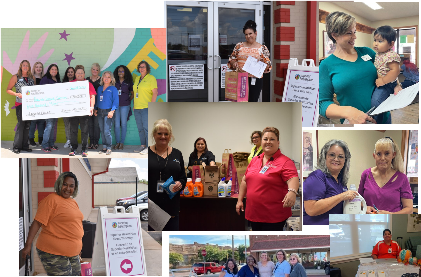
The Amarillo office opened a Hygiene Closet along with Superior HealthPlan Closets have also opened in Dumas and Hereford.